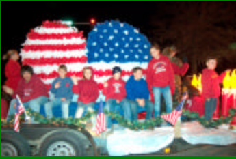
Sallisaw Chamber of Commerce